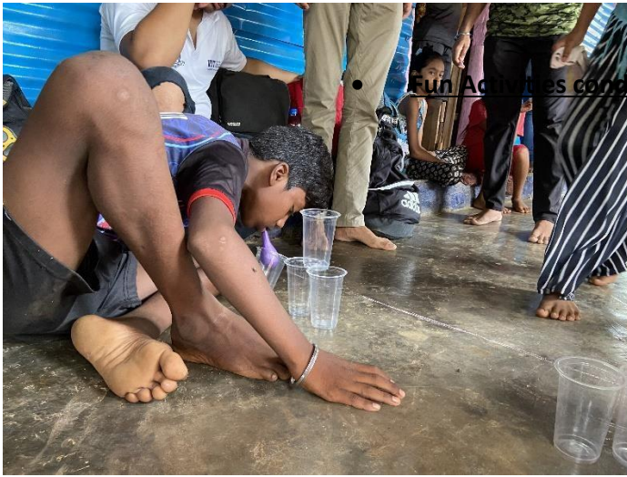
• Fun Activities conducted by our volunteers.