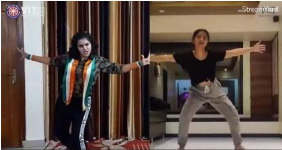
Welcome to NSS VIT's Webinar stay tuned till the end for feedback link